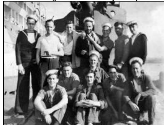
Some of the tragic crew of HMS TRIUMPH