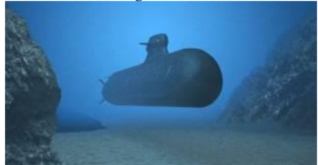
Artist's impression of the Saab Kockums A26-type submarine