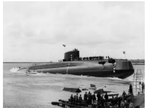
The launch of HMS RESOLUTION at Barrow in Furness on 15 September, 1966