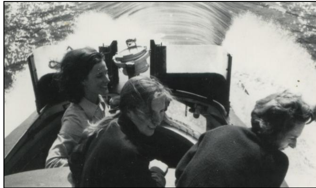
Nuclear Submarine HMS VALIANT - July 1969