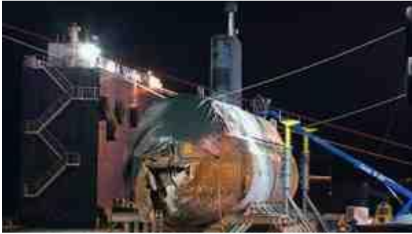
The damage to the HMCS CORNER BROOK was in the area in which sailors are quartered.

mail to CBC. "While I can say that more work has been done since then to look into what damage the submarine incurred, I have not been able to find out any details as to what was learned during these subsequent surveys."