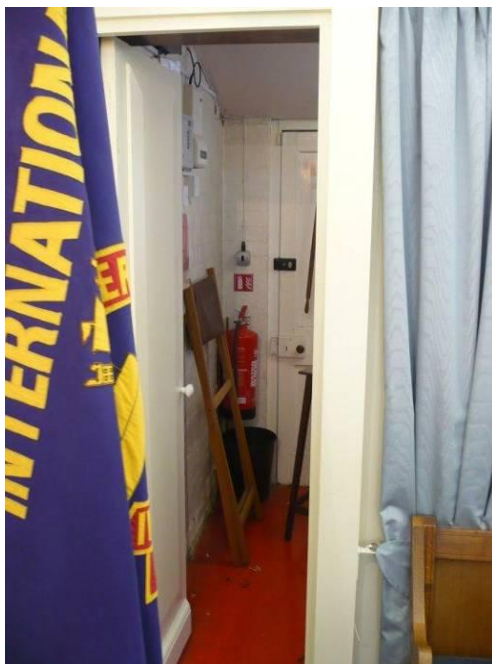
Many of them never came back!