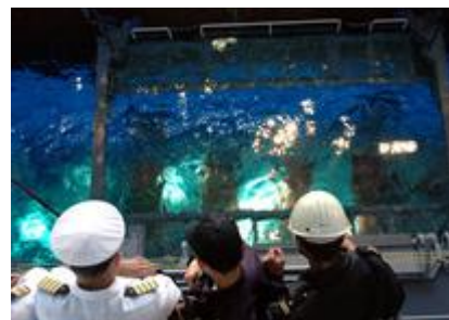
The Japanese demonstrate their Rescue Mini-Sub during Exercise Pacific Reach.