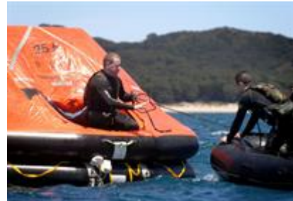
The SPAG team set up a floating casualty reception centre and treated simulated casualties escaping from a 'stricken' submarine.