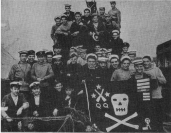
H.M. submarine "Trident" and her crew in a north-east port after her return from 18 months' service in the Mediterranean and Far East waters

business and social occasion of collecting the rum ration from the coxswain under the watchful eye of Jimmy the One. The rum-ration was a good idea. Known as Nelson's Blood, it burned the throat, and gave first of all, a feeling of security and well being. This was easily shattered in the course of a war-time submarine patrol. It fended off possible illness and gave an appetite for the cuisine. There was a strict code of exchanging "wets", "sippers" or "gulpers" for services rendered - all strictly forbidden of course.