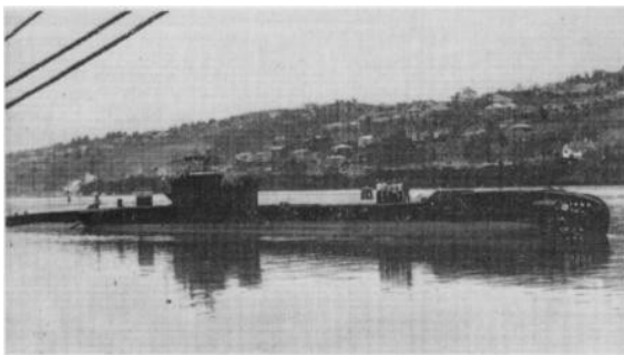
H.M. submarine "Tapir", a typical "T"-boat, the last in which the author served