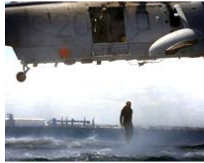
The UK's Royal Navy Submarine Parachute Assistance Group (SPAG) display their skills during a live demonstration on Exercise Pacific Reach.

Chile, India, Indonesia, NATO, Pakistan, Peru, Russia and South Africa have also attended.